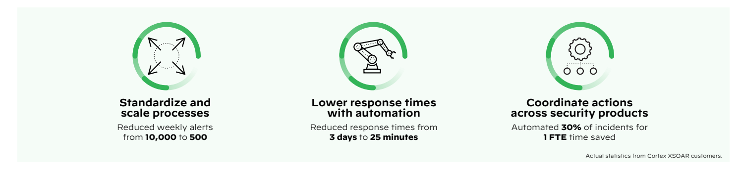
Figure 1: The value of Cortex XSOAR

Unify aggregation, scoring, and sharing threat intelligence with playbook-driven automation with native threat intelligence management. The built-in, high-fidelity threat intelligence can be boosted by layering additional third-party threat intel to better reveal and prioritize critical threats.